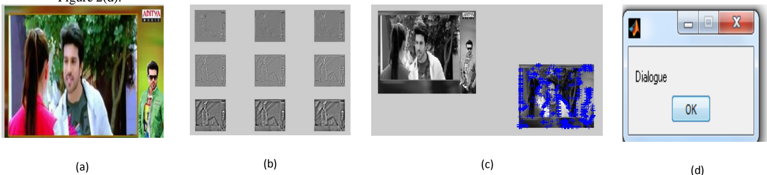
Figure 2: (a) Video Frames; (b) Gray Scale Images from Input videos Image; (c) Feature Extracted Images; (d) Output.

Figure 2 represent the experimental result of the proposed system. Firstly will consider the video frames as input image, which is shown in Figure 2(a) after considering video frames from the input video those frames are pre-processed, in that gray scale converted images shown in Figure 2(b), from those gray scale images will apply feature extraction methods SIFT and HOG. Extract features of those gray scale converted images as shown in Figure 2(c) next SVM classifier will classify the taken input video as which category by video annotation and retrieval method as shown in Figure 2(d).