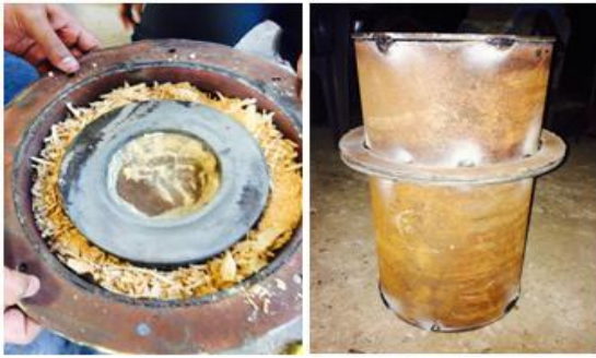
Fig.2 Moisture scrubber