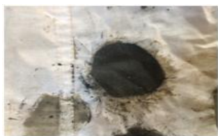
Fig.1 Fabric filter test

Fabric filter is used to figure out various impurities in the producer gas. A cotton cloth ( fabric filter) is kept at the outlet of the gasifier and after 20 seconds it is observed that the cotton clothe turn into black in color. As shown in figure, after some visible examination it is found out it consists tar, solid particulates and moisture.