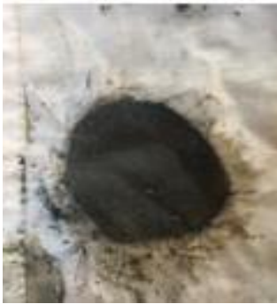
Before scrubbing Fig 5(a)

After tar and moisture scrubbing, quality of test is assessed on fabric filter. The significant change is observed.