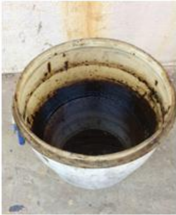
Fig. 3 Removal of tar

After passing from water wet scrubbing system almost all the tar and solid particulates get separated which is illustrated in the below figure.