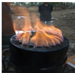
Before scrubbing Fig. 6 (a)

After passing the gas from scrubber the quality of the gas is enhanced.