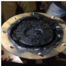
Fig. 4 Removal of moisture

After passing from moisture scrubbing system the moisture content of the gas is reduced significantly which is shown in the figure.