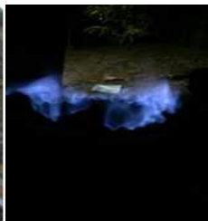
After scrubbing Fig. 6 (b)