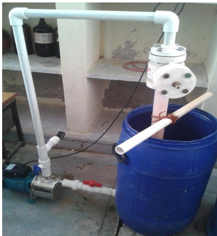
FIG. 1 HYDRODYNAMIC CAVITATION REACTOR

For hydrodynamic cavitation, experiments were performed in reactor of capacity 50 liters in which effluent was lifted and circulate by the pump of capacity 1 H.P. for different intervals of time without use of any chemical. Sample was kept for quiescent condition for 2 hours for the settlement of the precipitate. All experiments were carried out in batch mode. Several set of experiments were carried out to check the optimum range of time.