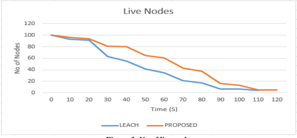
Figure 3. No of live nodes

If any node drain out his energy than he is no more in the network and if large no of nodes dies in the network than network lifetime is decrease. For that we used data aggregation technique to increase network lifetime. Fig.3 shows the no of live node at particular time is less in LEACH protocol but in our approach more live nodes at particular time.