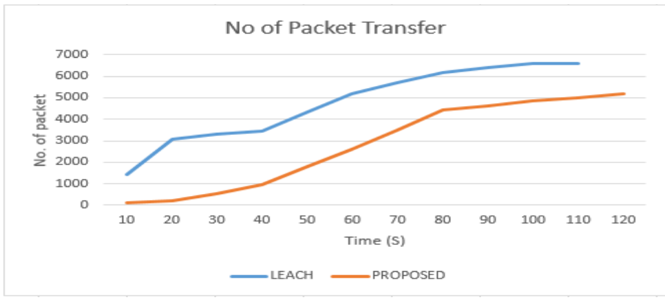
Figure 2. No of packet transfer

Large numbers of redundant data transfer from one sensor node to other which consumes most of energy of sensor nodes. In LEACH protocol CH combine member nodes data and forward directly to the base station which require more energy. But in our algorithm data are first aggregated at CHs and only a small aggregated data is forwarded to BS. For aggregation we used AVG (AVARGE) Function. . Fig.2 shows the no of packet transfer to the base station is less than LEACH protocol because of aggregation.