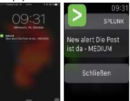
Splunk Push Alert on iOS Splunk Alert on a iWatch

Set up an alert if a letter drops into the postbox, and the Splunk Alert is pushed directly via the Splunk App to his screen. That push notification is also displayed on our iWatch.