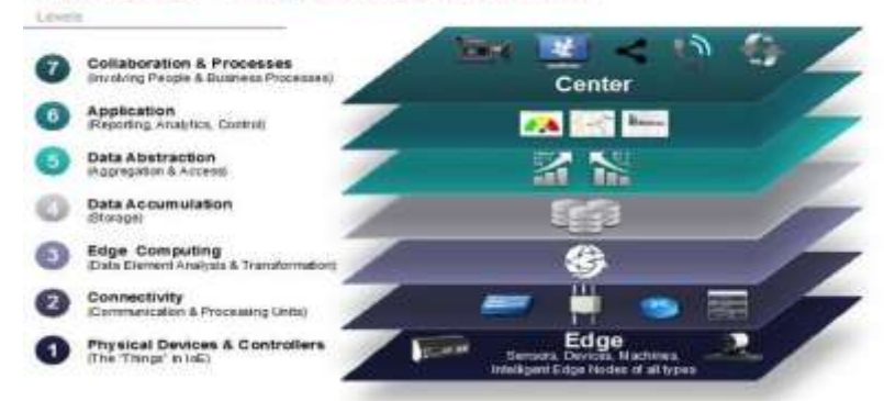
Fig: 1 IoT Reference Model[10]

• The very first level is includes devices, sensors, machines etc.