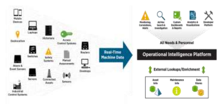
Fig: 4 Internet of Things kepware diagram by Splunk

Disparate and deployed connected devices can provide the enterprise a unique touch point to real-world operations and conditions. But collection, storage and insight of the machine data generated by the IoT can be a challenge. Splunk software ingests, analyzes and visualizes real-time and historical machine data from any source—including industrial control systems and connected devices—enabling you to improve operations, ensure safety and compliance, perform preventative maintenance and better manage the lifecycle of assets. Use Splunk to collect, index and harness the power of the machine data generated by connected devices and machines deployed on your local network or around the world.