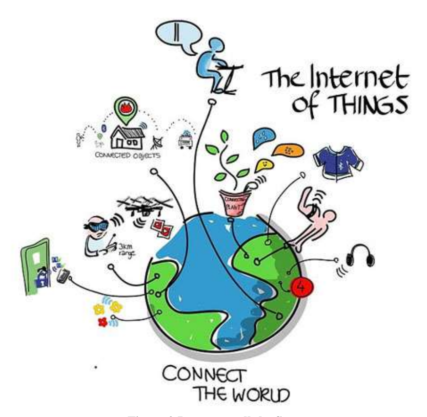
Figure 2 Impact on all the Sector

We already are using GPS technology in mobile. You will get empty milk carton information in car before you reach home. May be car inform to another car about bad roads, traffic jam ,best restaurants. May be driverless cars also will run on roads.