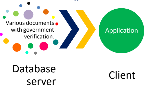
Fig1: Relation between client and database.

After Jan Dhan, the Centre now plans to offer a "digital locker" to every Indian. The government hopes the plan will eliminate the need for people to carry hard copies of certificates issued by states, municipal agencies and other bodies and be the next step to empower citizens [1]. Now the documents of the user can be on the cloud. Government can monitor your income-tax returns, latest bank transaction and documents of the property. What the government will be able to do is pretty much explained in the below figure.